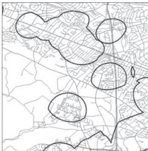
Figure 1. Hot spots ellipses: Composite areas.

identify the intersections 5 of crime incidents in both years, including robberies, burglaries, and personal injury crashes. 6 They then developed composite hot spot areas, where hot spots for each type of incident overlapped (see Figure 1).