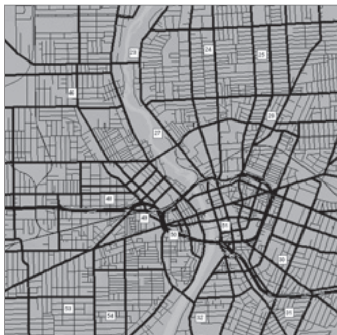
Figure 2. Example of a calculated raster layer.