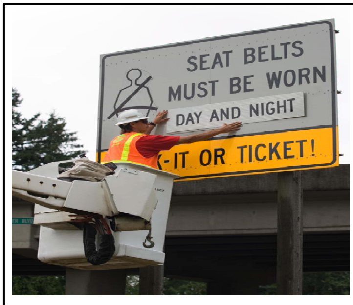
A roadside sign in Washington State is updated to reflect the importance of buckling up both day and night.

NHTSA is examining experience and evidence concerning nighttime seat belt programs. This paper shares information collected to date that could help law enforcement agencies plan successful nighttime seat belt emphasis patrols for the next CIOT Mobilization. In addition to the following, two detailed research papers with results from several of our recent nighttime belt enforcement projects are expected in the fall of 2008.