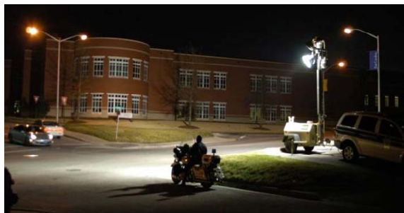
Pitt County, NC, nighttime enforcement effort