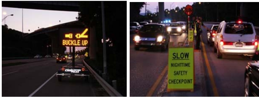
Charleston, West Virginia's Safety Enforcement Zones

equipment needed to run night-time zones (variable message signs, reflective vests, cones, portable lights, a trailer, etc.). Efforts were carefully explained as “safety zones” and “belt zones” or “belt checkpoints,” given that the focus here was on seat belts and West Virginia is a secondary law State. This seat belt operation resulted in significant increases in impaired driving and other criminal arrests. Several officers were engaged in the operation since the zones were conducted in high traffic and highly visible locations. A great deal of earned news media was generated for this effort.