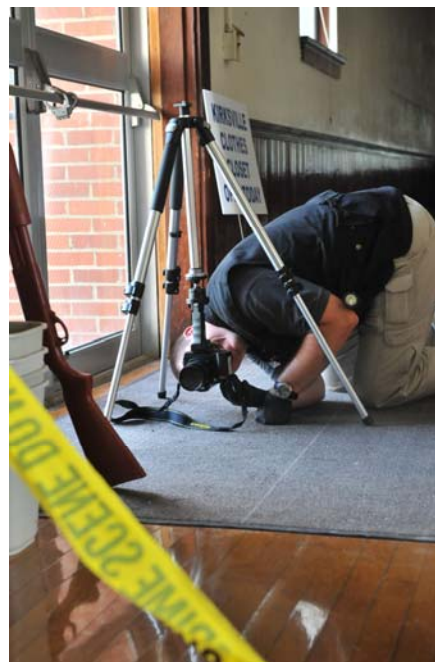
Officer trainee contorts his body to photograph blood evidence on the handle of a shotgun found at a mock crime scene.

who is a graduate of the National Forensic Academy and instructor in Eastern Kentucky University's forensic science department. "Every section of this training is crucial because every scene is going to be different. We give them a tool box full of tools. Whether they use all the tools on one scene or a few on this one and a few on that one, they are all important and necessary."