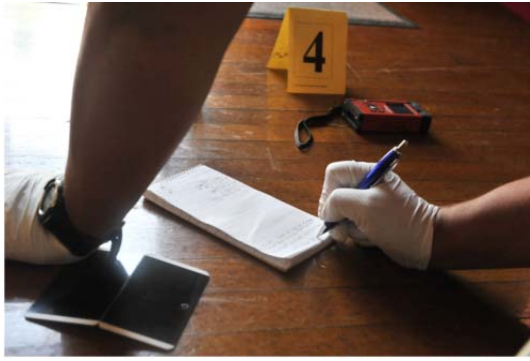
Officer records detailed information about bloody footprints found on the scene of a shooting.

The Department of Criminal Justice Training is a state agency located on Eastern Kentucky University's campus. The agency is accredited by the Commission on Accreditation for Law Enforcement Agencies and was the first accredited public safety-training program in the nation. In 2006, the academy also became the first law enforcement training academy in the nation to be designated as a CALEA flagship agency.