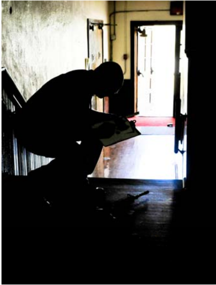
Trainee records detailed information about a weapon found on the scene of a mock community center shooting in Kirksville.