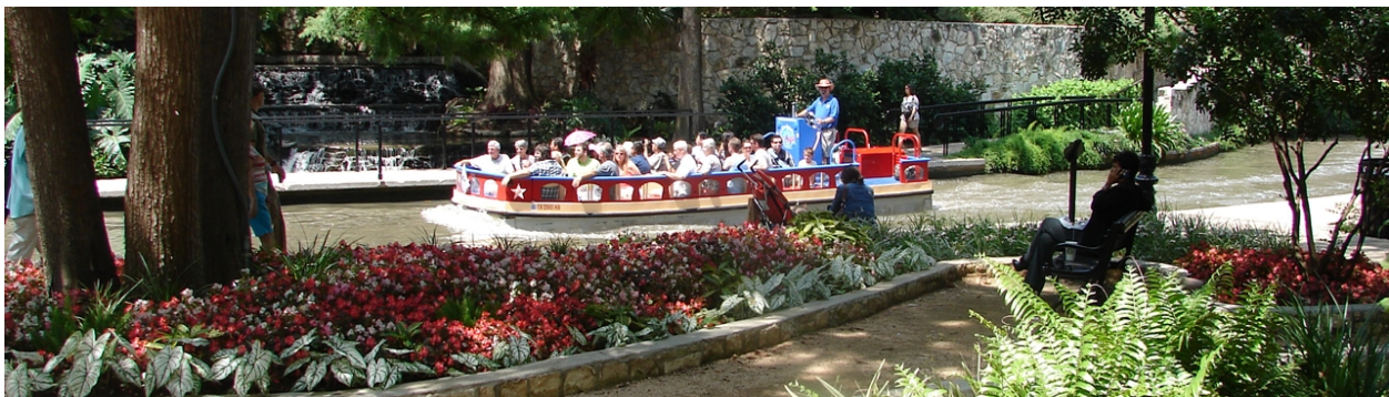
San Antonio, Texas Riverwalk District