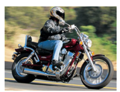
ALL THE GEAR ALL THE TIME