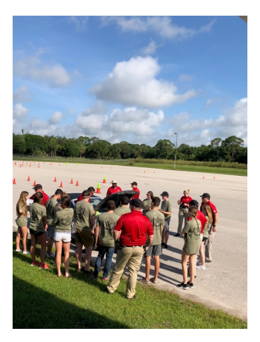
"FLORIDA SHERIFFS ASSOCIATION Protecting, Leading & Uniting Since 1893."