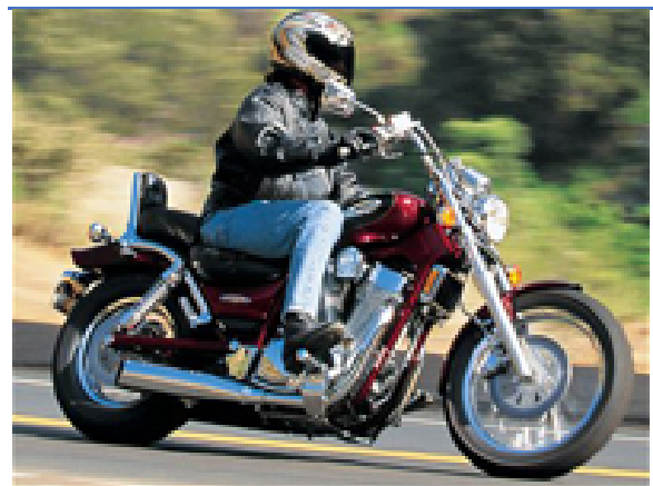
All the gear all the time