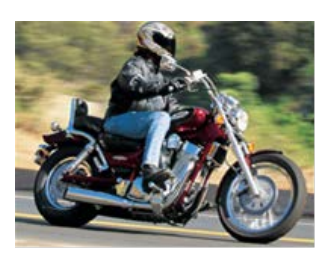
Watch for Motorcycles

Contact us to inquire about our 2014 regional ESC Schedule.